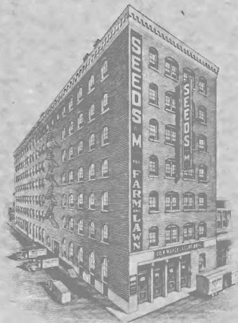
OFFICE AND MAIN PLANT 500 SO. FIRST ST., ST. LOUIS